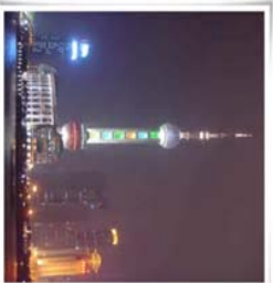
Shanghai Night Scene