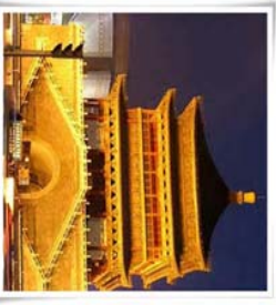
Bell Tower, Xian